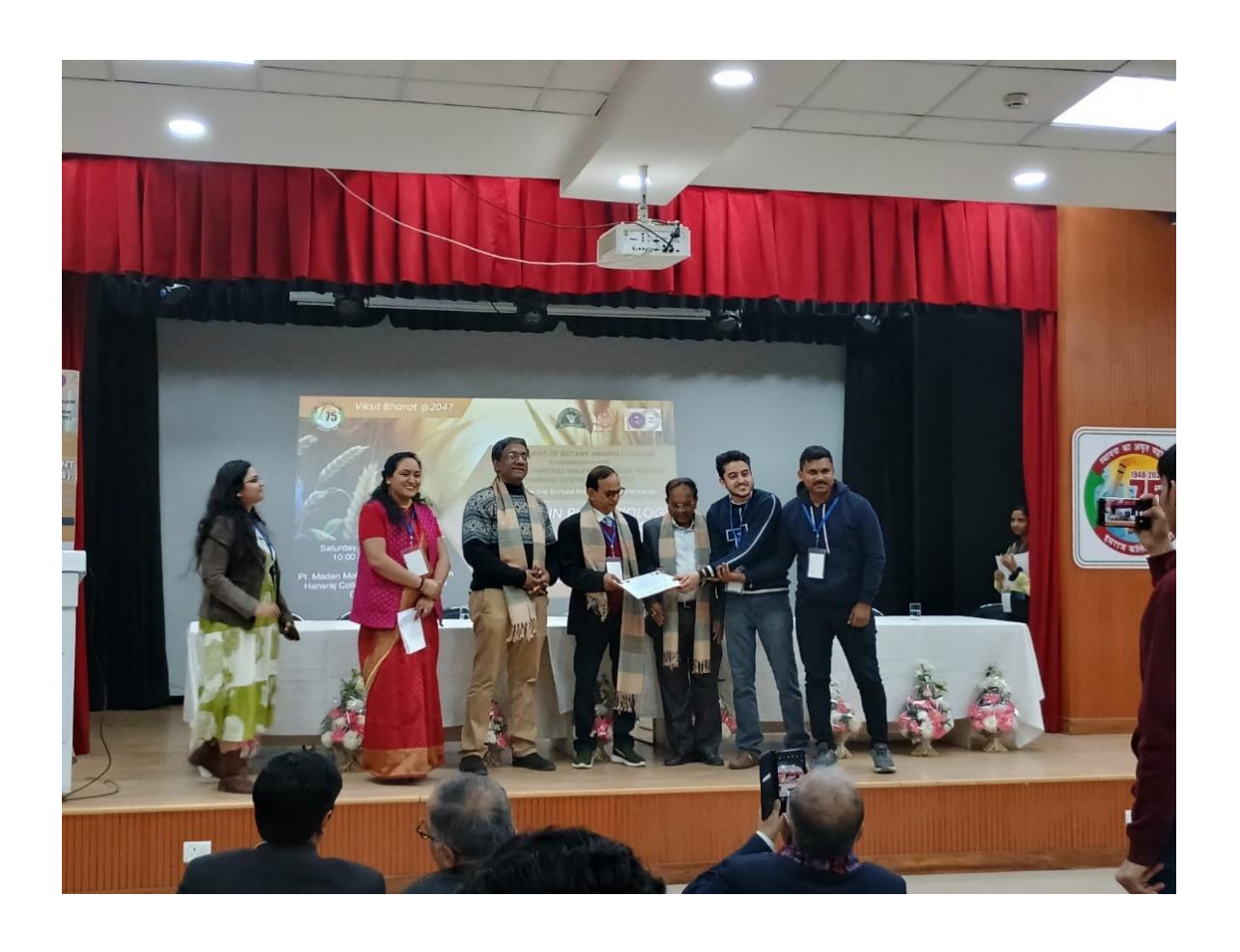
List of Participants (Event: : Inauguration of P.N. Bali Mushroom Cultivation Centre; Date: 4^{th} May 2023)