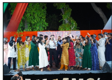
Sangam (Alumini Meet) 2024