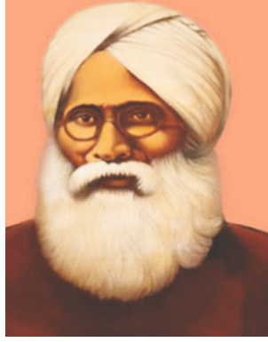
Mahatma Hansraj (1864-1938)

The College was founded to preserve the memory of Mahatma Hansraj, acknowledged as the founding father of D.A.V. movement in undivided India. Frail in body but heroic in spirit, Mahatmaji was selflessly dedicated to the cause of education. He started his career as the Honorary Founder Head Master of D.A.V. School, Lahore in 1886 and over the next 50 years went on to guide the destiny of D.A.V. movement in India.