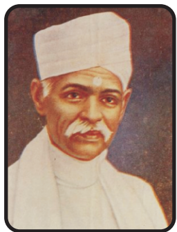
Pandit Madan Mohan Malviya

Mahatma Hansraj Faculty Development Centre (Under PMMMNMTT an MHRD initiative) Hansraj College University of Delhi